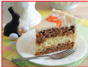
WHOLE CAKE $44.99