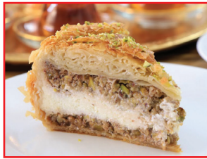
WHOLE PLAIN CHEESE CAKE $54.99