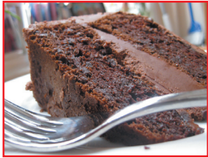
WHOLE PIE $32.99