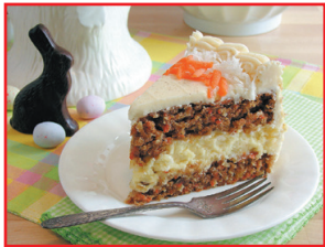
WHOLE CAKE $44.99