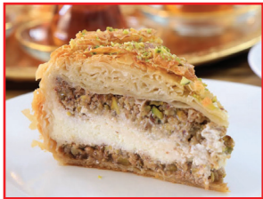
WHOLE PLAIN CHEESE CAKE $54.99 WITH FRUIT TOPPING $64.59