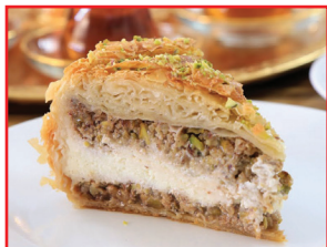
WHOLE PLAIN CHEESE CAKE $49.99

ALL HOMEMADE/BAKING DONE ON PREMISES “For the Sweet Tooth”