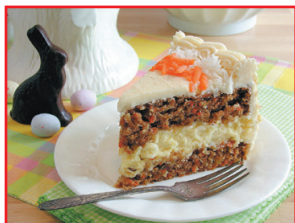
WHOLE CAKE $39.99