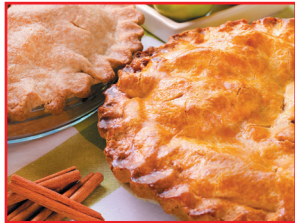
WHOLE PIE $29.99